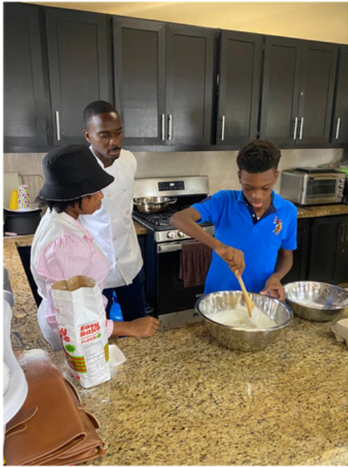
Y o u t h E l e v a t i o n S c h e m e