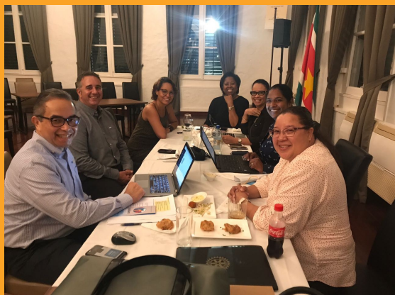
Rotary Club of Paramaribo Central