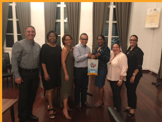
Rotary Club of Paramaribo Central