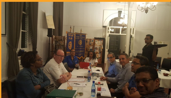
Rotary Club of Paramaribo Residence