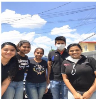
Members of the Club pose for a picture after grocery items were distributed.

Photos were shared of our Rotaractors and their at-home cinematic set-ups. Despite all the buffering happening that night, it was loaded with fun! The event was truly a hit with Rotaractors expressing it was a "Great movie night!".