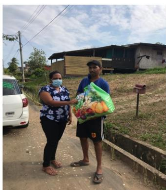
One of our Members presenting a grocery hamper to the father of one of the target families.