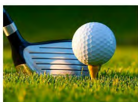
THURSDAY 26TH APRIL 2018 GOLF CLINIC AT GOLF CLUB PARAMARIBO Price: USD$40.00 More Info (EN) / More Info (FR)