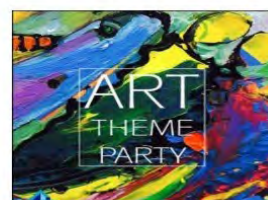
SATURDAY 28 TH APRIL 2018 ART THEME PARTY Price: USD$35.00 More Info (EN) / More Info (FR)