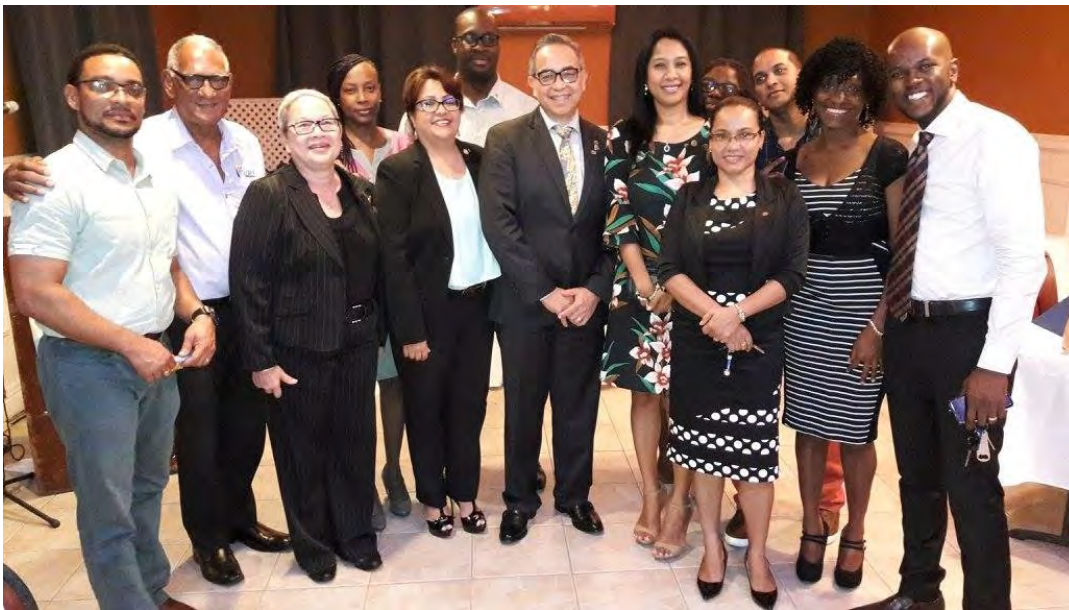
With the members of RC Stabroek