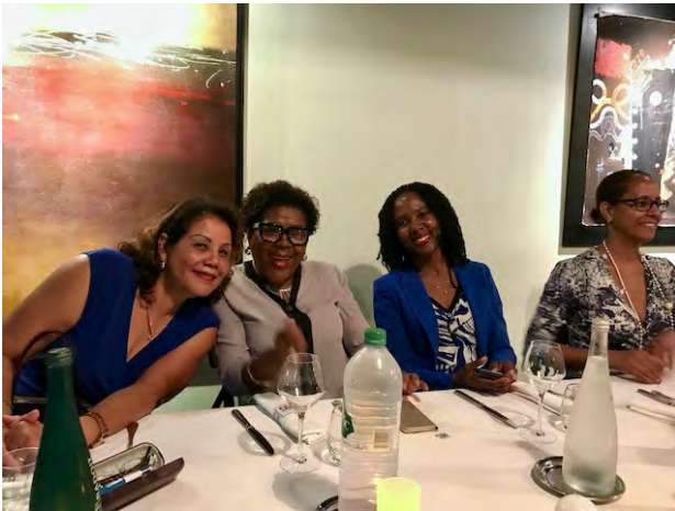
RC of Cayenne-Est