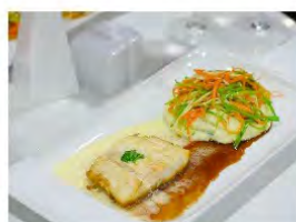
FRIDAY 27TH APRIL 2018 SURINAMESE TROPICAL LUNCH WORKSHOP Price: USD$35.00 More Info (EN) / More Info (FR)