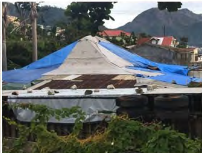
Roofs of Operation Youth Quake and current Grotto Home for the Homeless