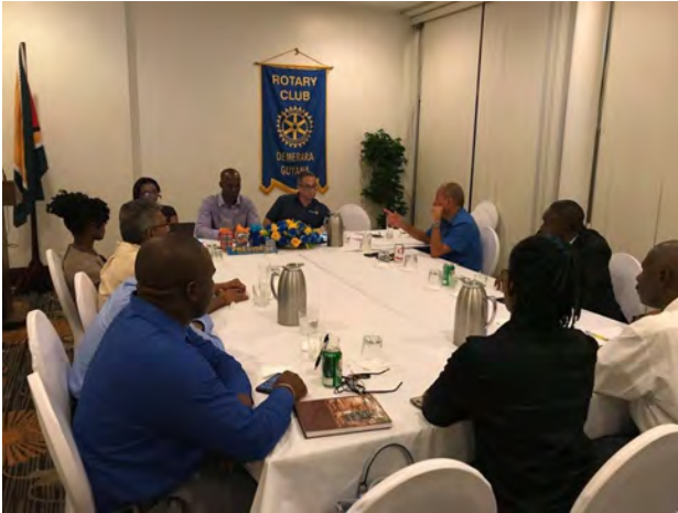
Meeting with the Board of RC Demarara