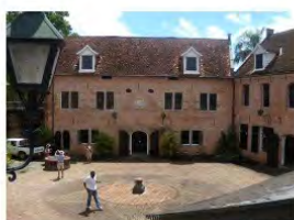
THURSDAY 26TH APRIL 2018 CITY HISTORICAL BUS TOUR Price: USD$40.00 More Info (EN) / More Info (FR)