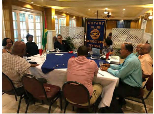
Meeting with the Board of the RC of Georgetown Central