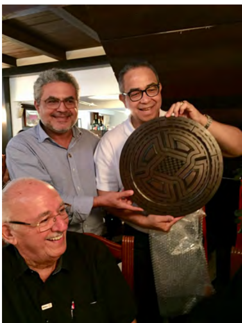
Thank you RC of Cayenne