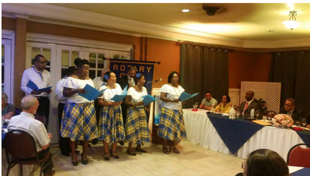
Welcome song by First born Rotary Choir at joint meeting