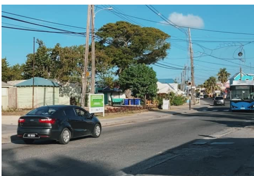
RC BARBADOS SOUTH - Bus Fare Community Give Back Initiative