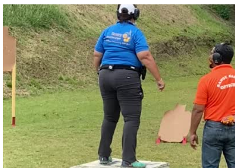
RC Pointe-a-Pierre - Firearms Awareness Webinar and Fundraiser