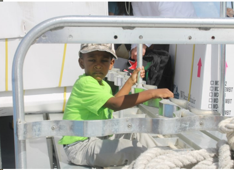
Early Act ?n the making? ?????