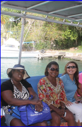
It all started with a boat trip to lovely Soufriere on the west coast.

From all indication, this project was a huge success. It brought smiles to many faces across the country from Gros Islet in the North, Babonneau in the East, Vieux Fort in the South and Soufriere in the West. It started with a gift from