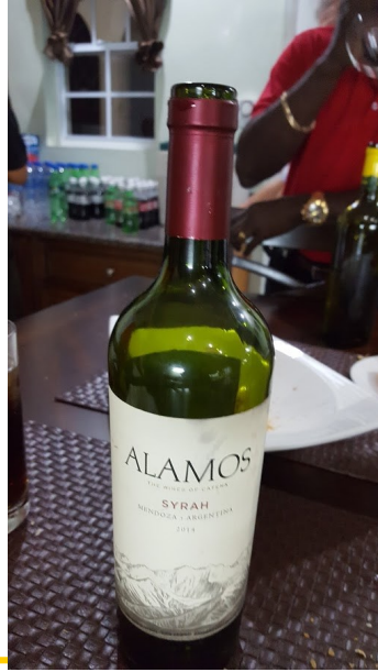
Wine for wheels