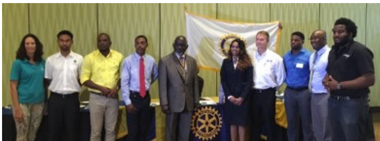
Sponsors and Recipients