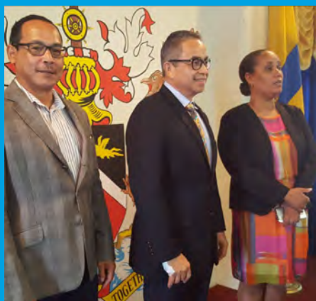
AG and DG meet Mayor of Arima