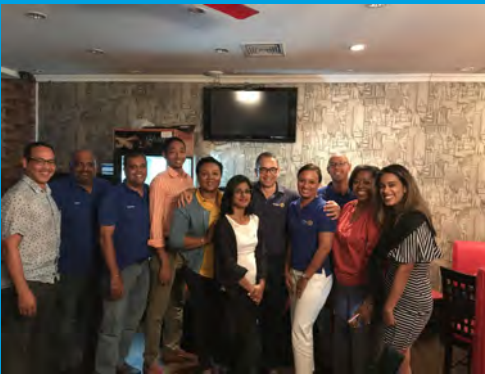
Rotary Club of Piarco