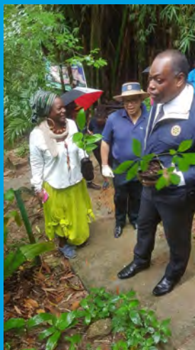
Planting a tree in style