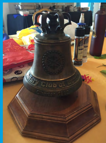
Rotary Club of Bonaire, Rotary Bell