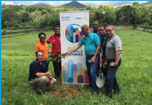
East Cluster Presidents with DG at tree planting in Arima