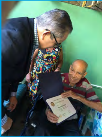
Presenting a PHF to former Charter member from Rotary Club of Sangre Grande