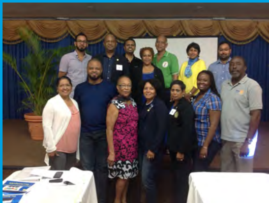
RLI part 2 Trinidad