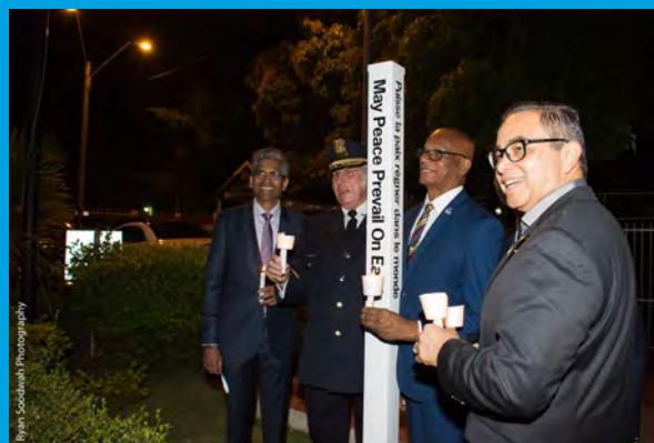
Unveiling the peace pole, Rotary Club of Princes Town