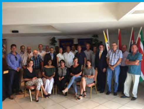
Members of Rotary Club of Bonaire