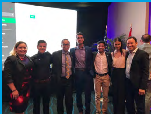
Interactors and Rotarians from Rotary Club of Aruba