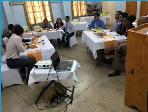
Board meeting with Rotary Club of Sangre Grande