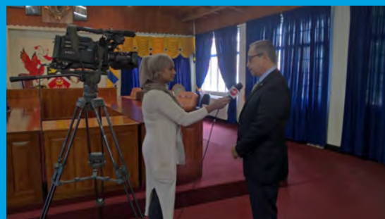
DG was interviewed by a TV news crew who happened to be at the building covering another story that day.