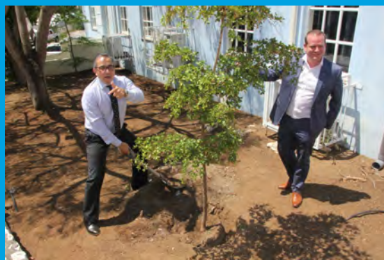
Tree planting with Rotary Club of Curaçao