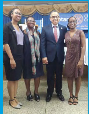
Induction of 3 members of the Rotary Club of Maraval