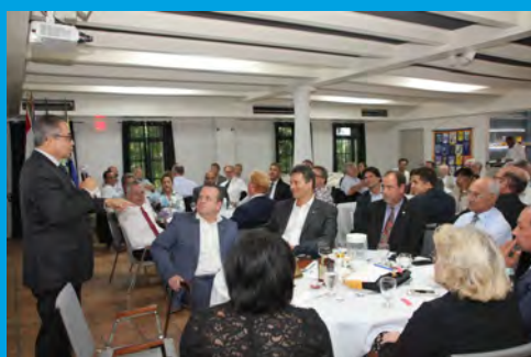
Rotary Club of Curaçao