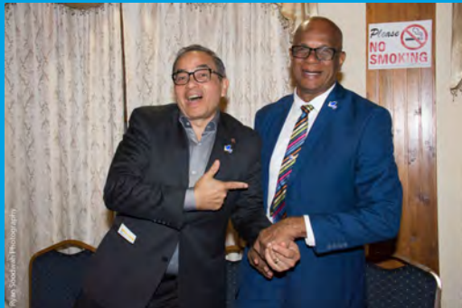
Peace event, Mayor of San Fernando