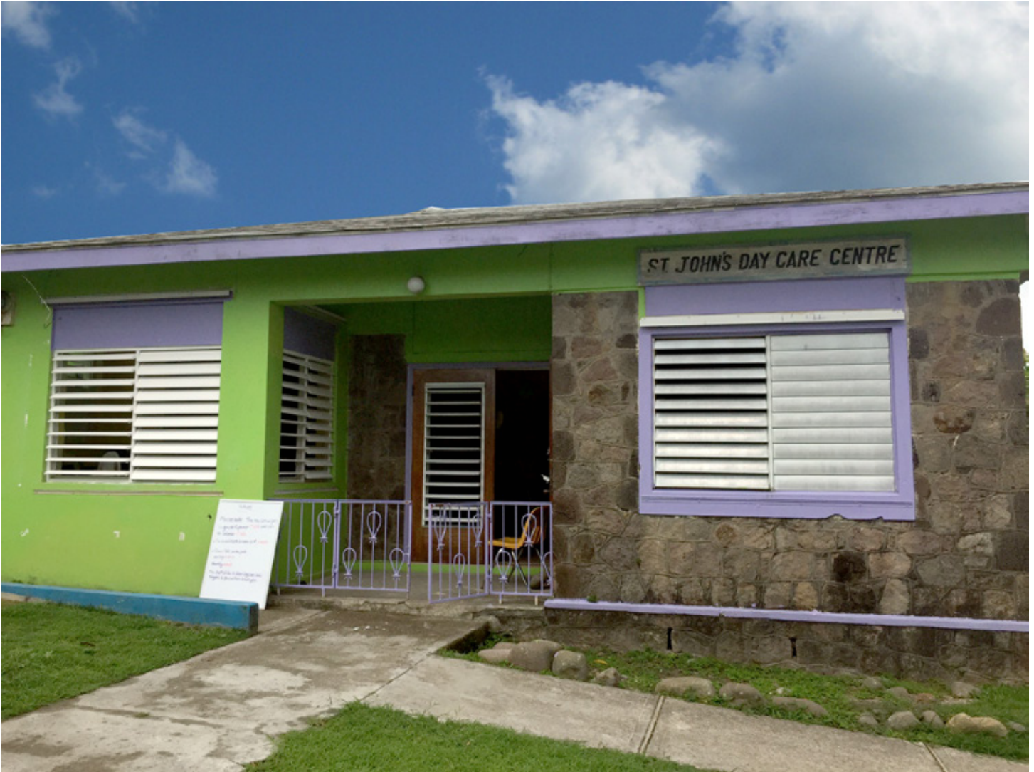
St. John's Day Care Centre

Arriving in Montserrat after a short flight from Antigua, we proceeded from the airport, lined with Rotary signage erected by RC Montserrat, to a radio talk show. From there, we visited the St. John's Day Care Centre, repainted by the Interactors.