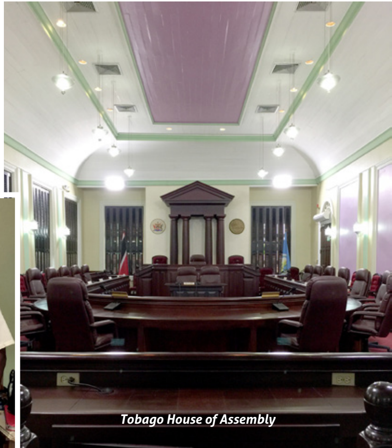
Tobago House of Assembly

The next day, we had a tour of Tobago, visiting the Tobago House of Assembly and Argyll Falls, prior to our departure to Trinidad.