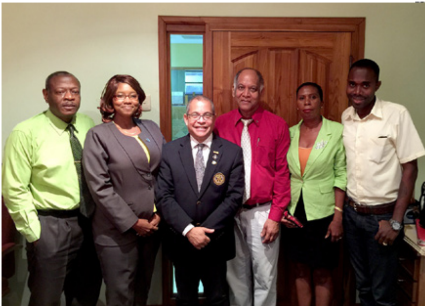
Meeting with RC Tobago