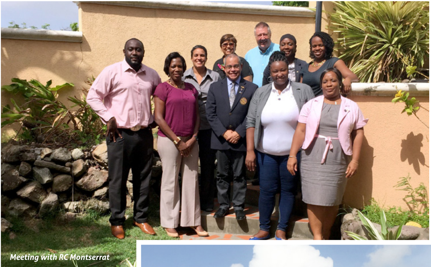
Meeting with RC Montserrat

Highlighted Projects Road Signage Project displaying 4-way test and protect our children signs – Montserrat