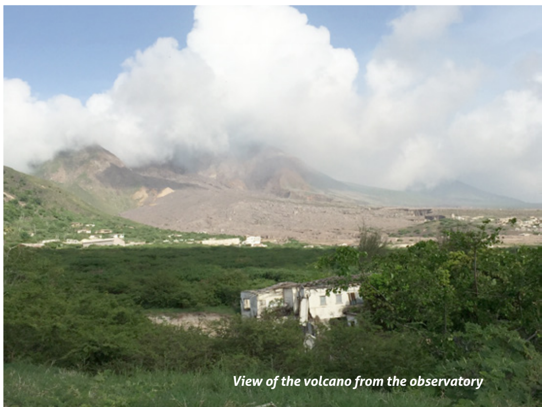
View of the volcano from the observatory