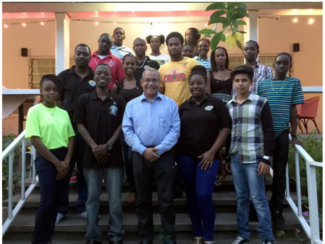
Meeting with the Rotaractors and Interactors