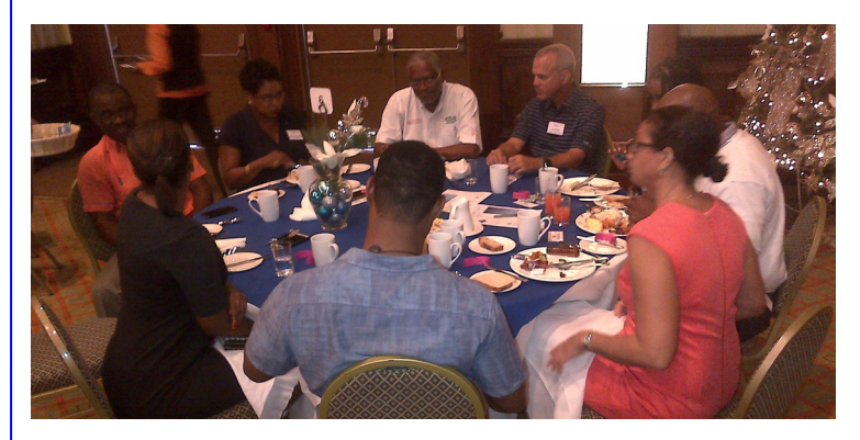
Table 6 volunteered, but were disappointing as they only got two lines presented correctly in what SAA Heather described as a "Rum Shop

SAA Heather, asked for a purposeful rendition of Auld Lang Syne as she would be unable to venture out to the Celebrations later that evening. The table proving to be worthy of the accolade would be exempt fines.