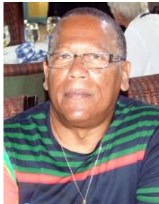
VR Francois Vaudreuil Martinique