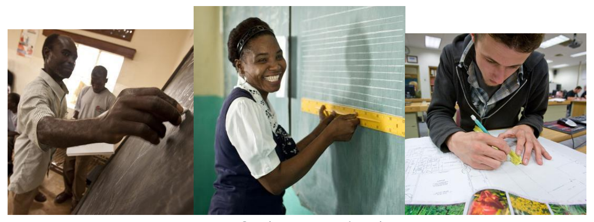
Our impact on education

How Rotary makes help happen We take action to empower educators to inspire learning at all ages.