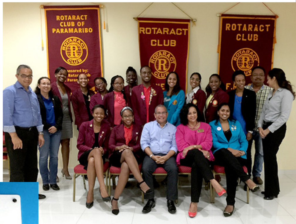
Meeting with Rotaract Clubs of Suriname