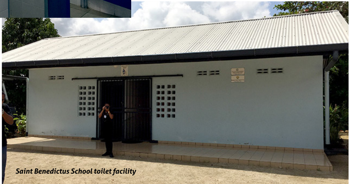
Saint Benedictus School toilet facility