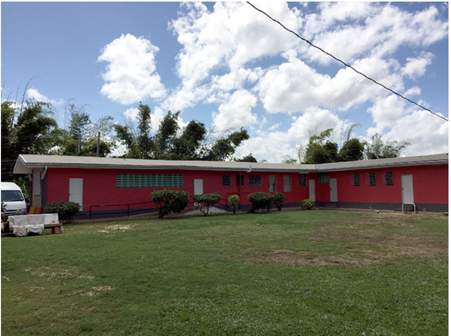
Memisa Residential Centre Arima

plays an important part in the centre, having provided covered walkways, tiling and clothing to the facility. We then visited the Eco Park, a project of the Piarco Club. The club has provided play park equipment and other facilities for the residents of St. Helena, who look after the facility with