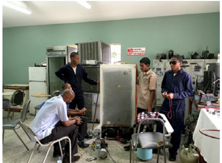
Students at Servol learning refrigeration