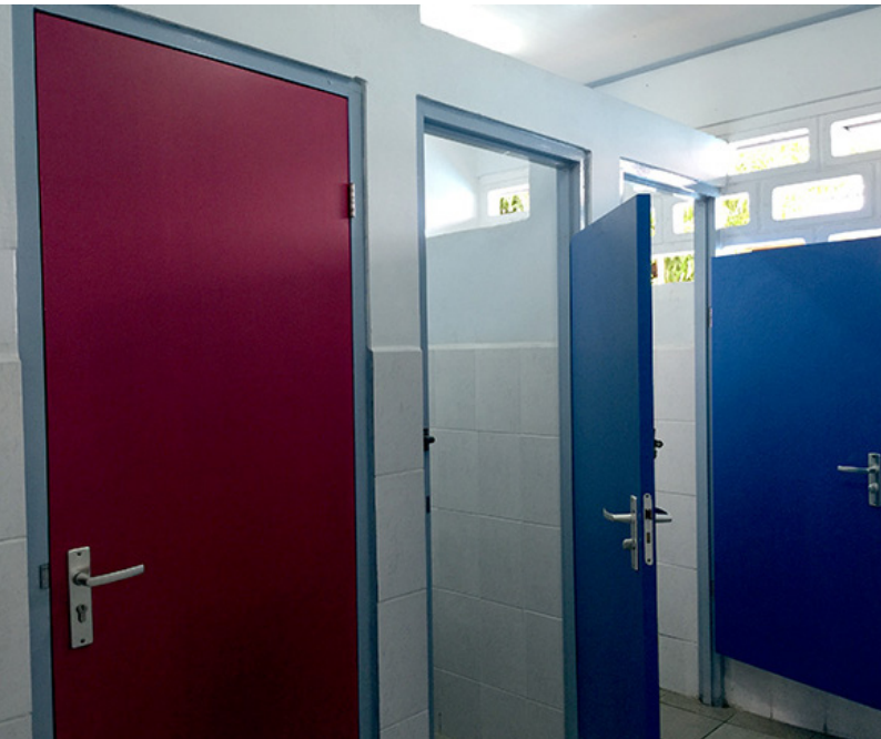
Renovation of toilet facilities at Shri Ganesh Primary School