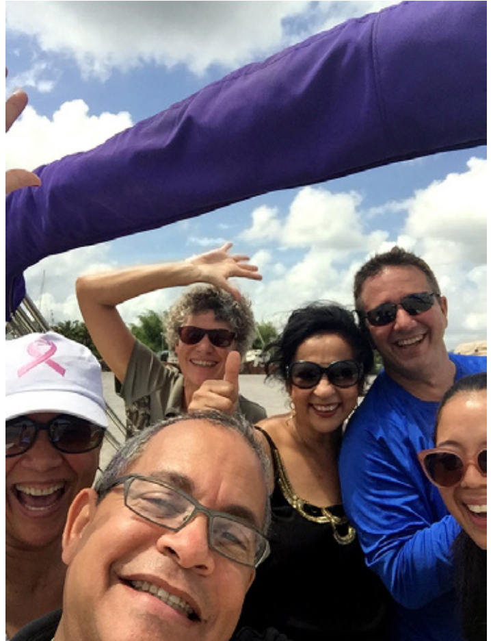
Fellowship on the river

On Thursday, we visited the Shri Ganesh and Saint Benedictus Schools to view the renovations that had been done to the toilet facilities along with other improvements such as gardens and the renovation of old facilities into a computer lab.