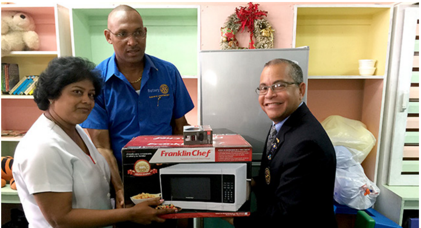
Presentation of microwave in Pediatric Ward at Mount Hope