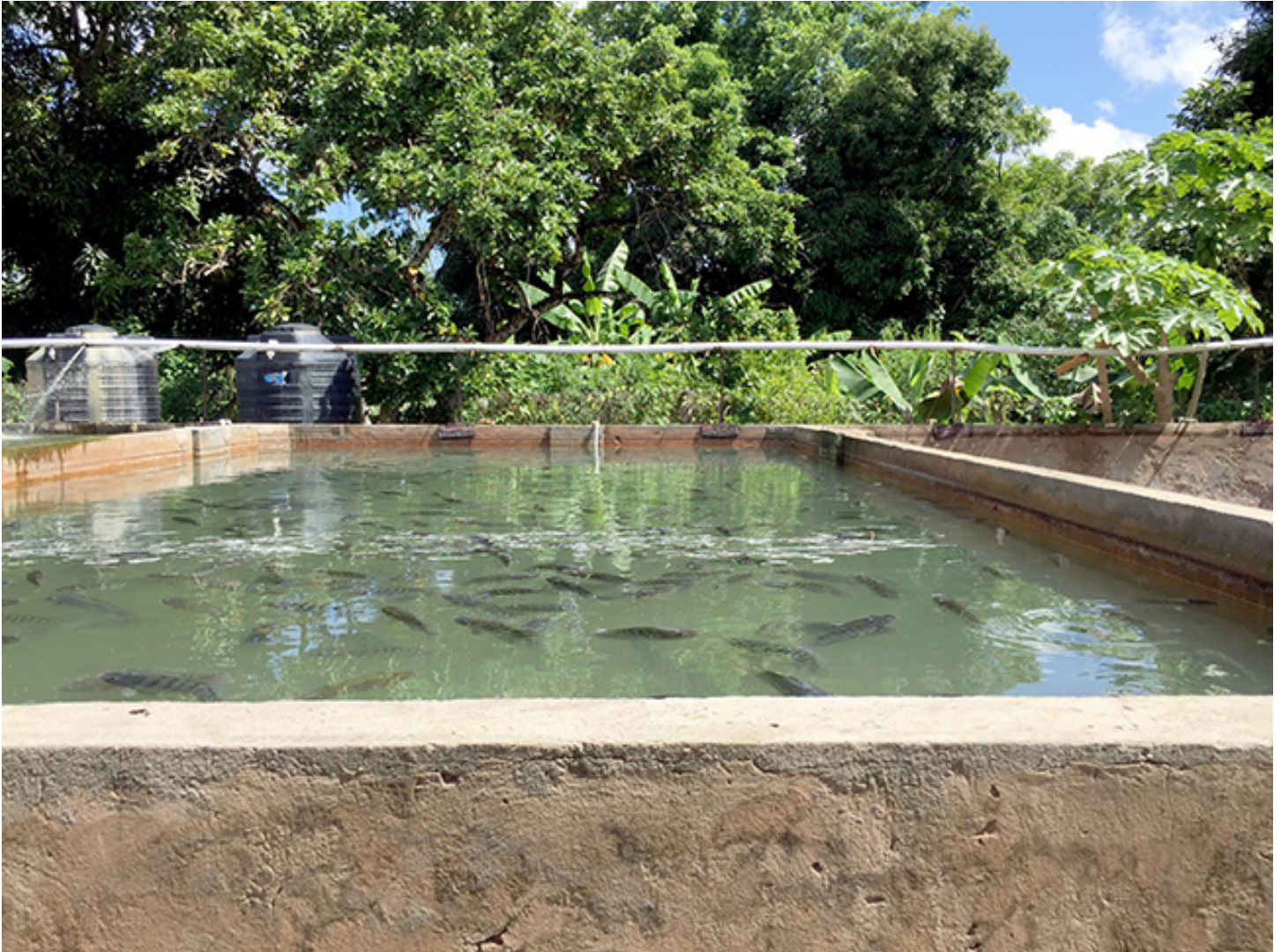
Fish culture programme at Memisa Arima

ing the various classes, meeting the students & teachers and having lunch prepared by the school. Servol provides an adolescent developmental programme and a skills training programme in various facilities throughout Trinidad. The facility in Saint Andrews, ably supported by the Sangre Grande club, provides skills in electrical installation, welding, air-conditioning & refrigeration, auto-mechanics, food preparation and home health aide.