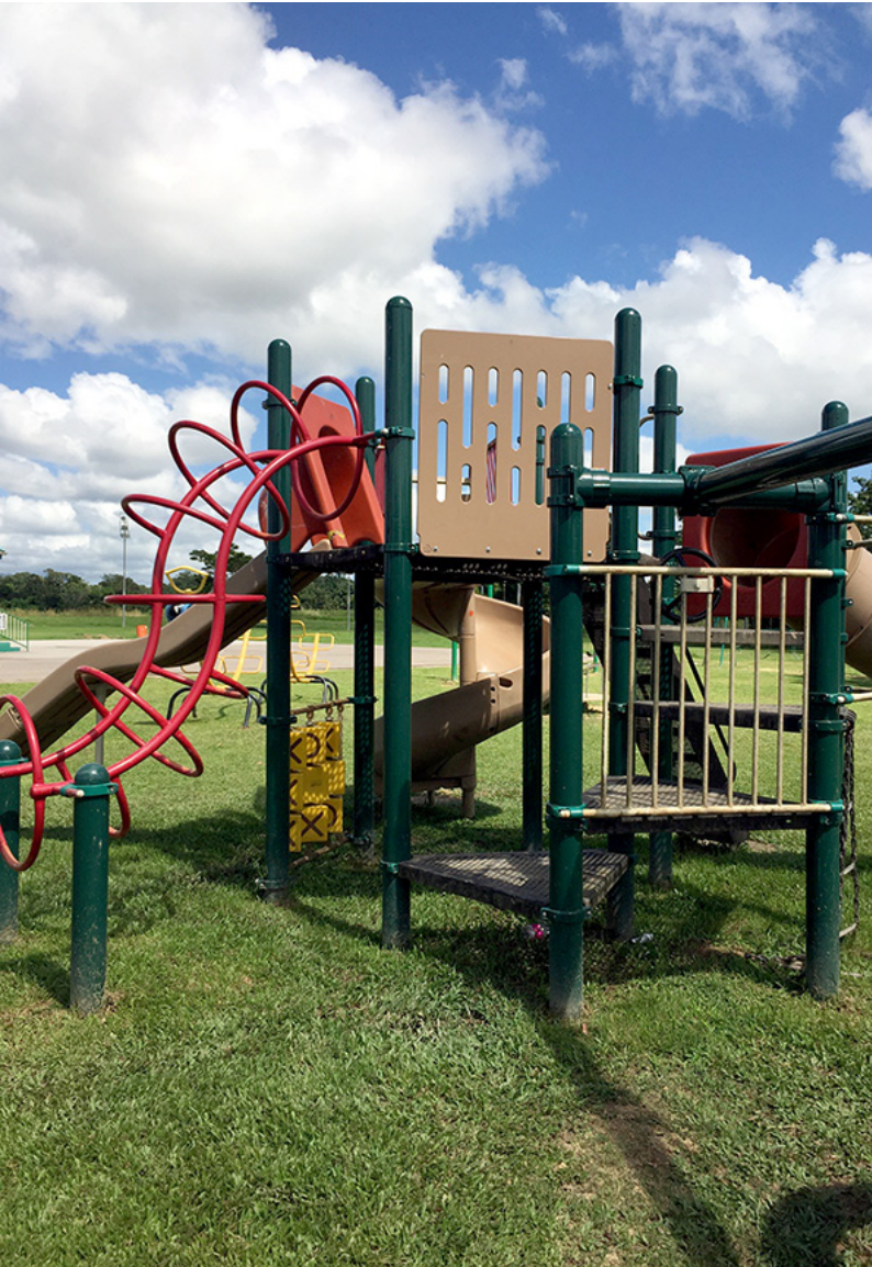
Play park at Eco Park