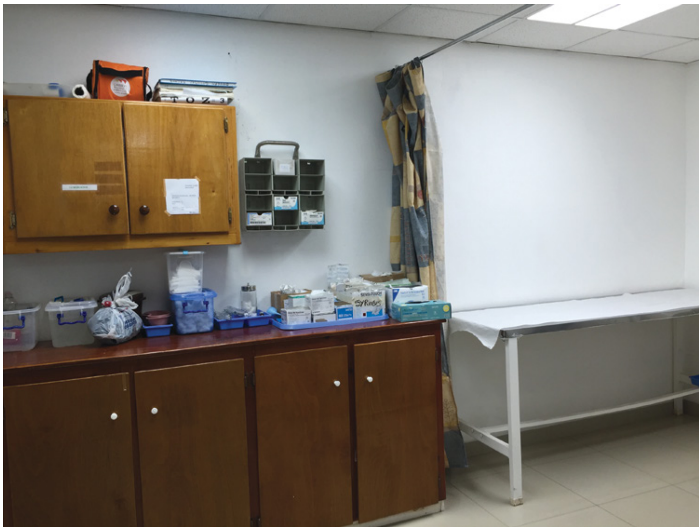
Treatment room in the emergency area