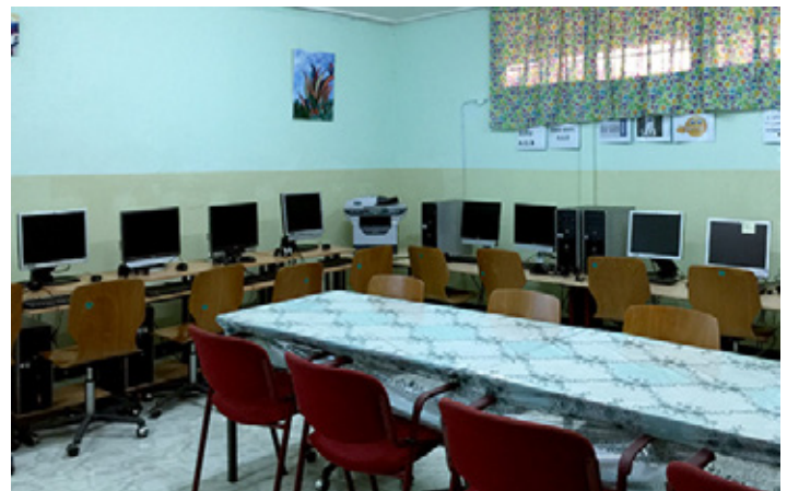
Computer Room at Saint Benedictus School