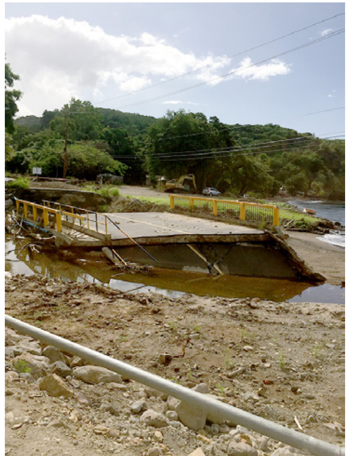
Part of a bridge lying in the riverbed

The evening ended quietly with a board game night hosted by President Lise, before a 5am departure for the airport the next morning.