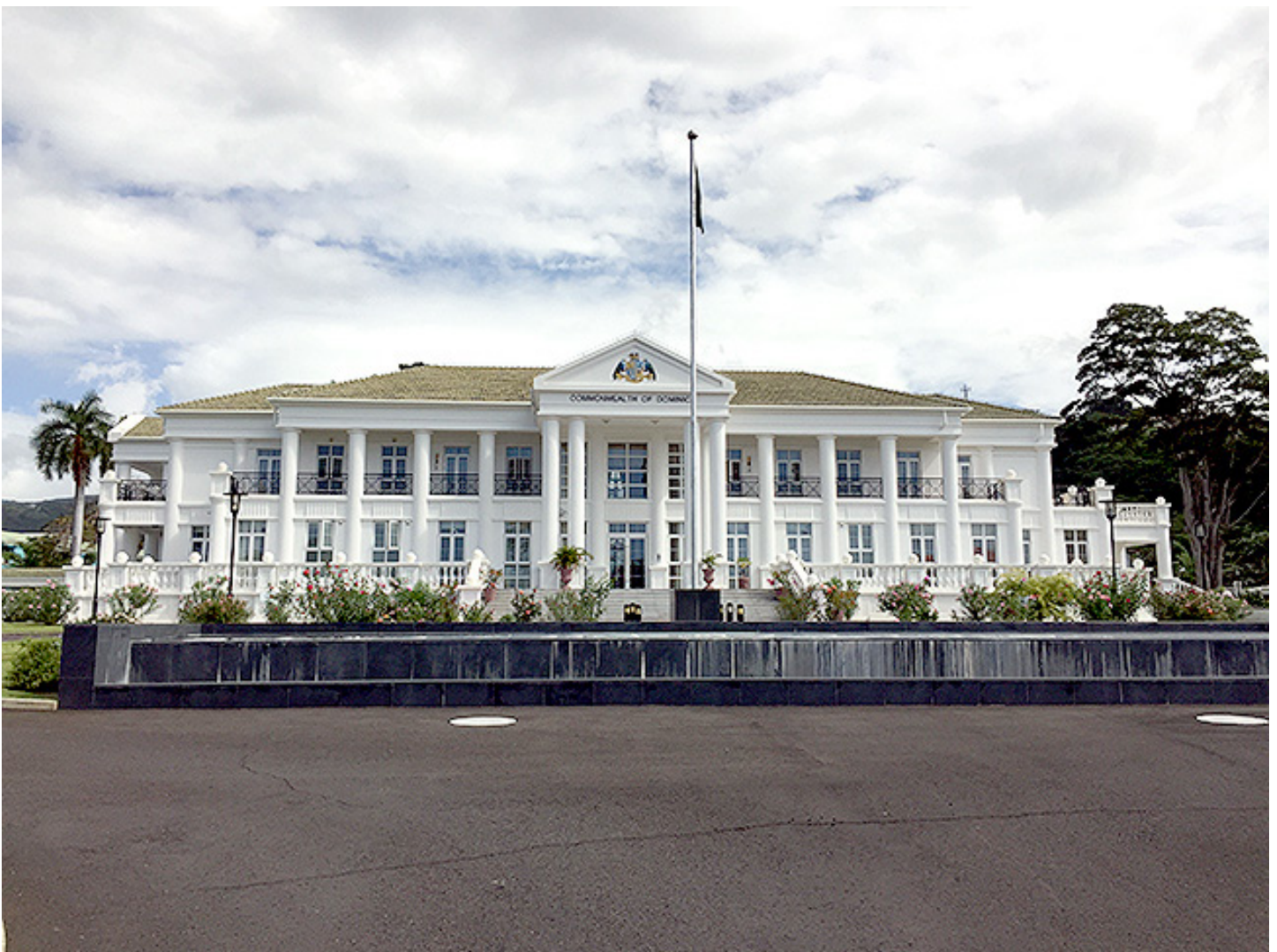
Government House, Roseau

That afternoon after my board meeting with the Rotary Club of Dominica, there were presentations of vouchers to Dominicans who had lost their ability to work after Tropical