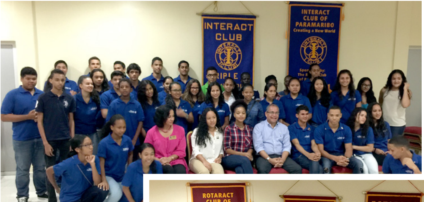
Meeting with Interact Clubs of Suriname