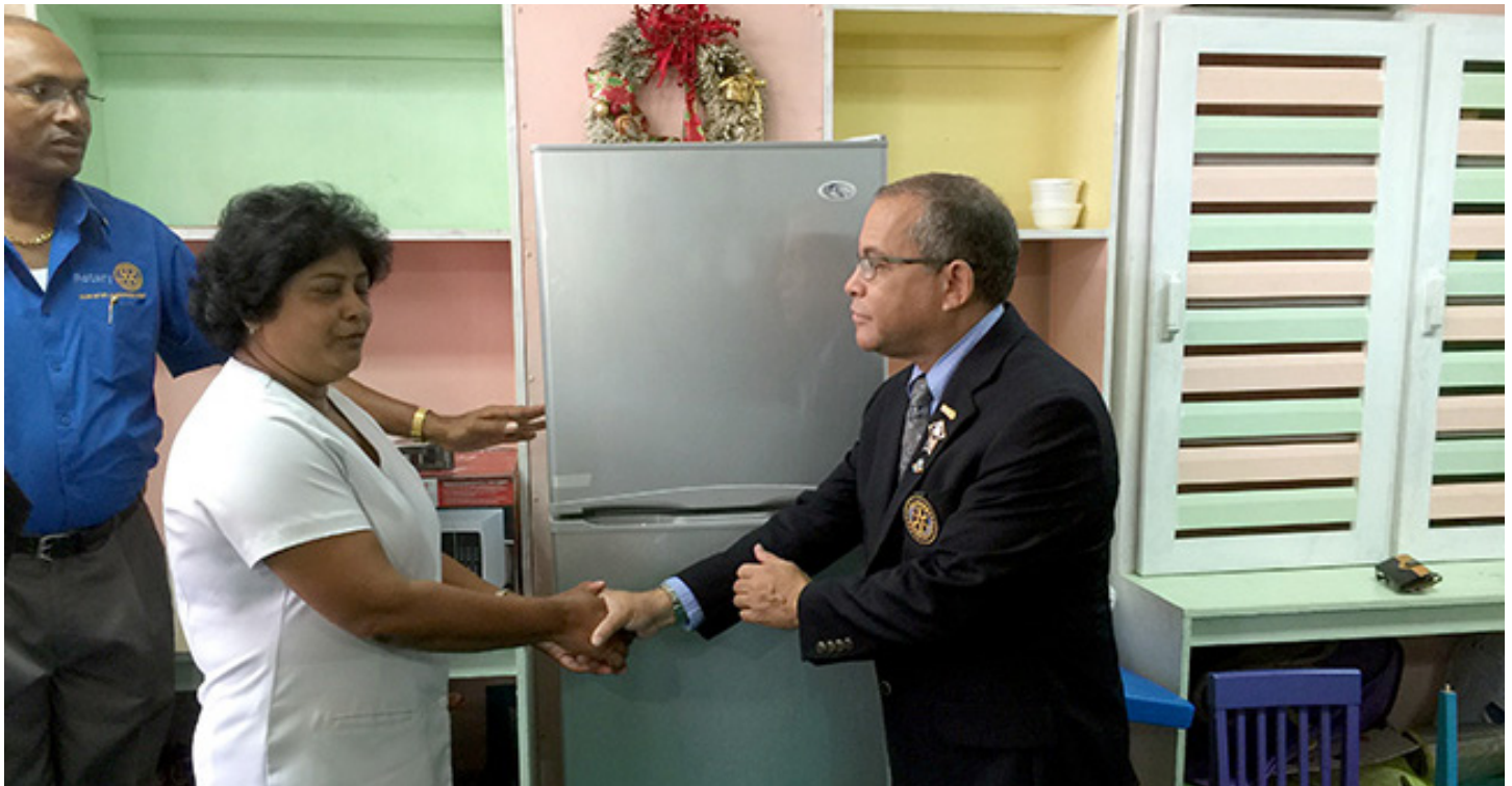
Presentation of refrigerator in Pediatric Ward at Mount Hope