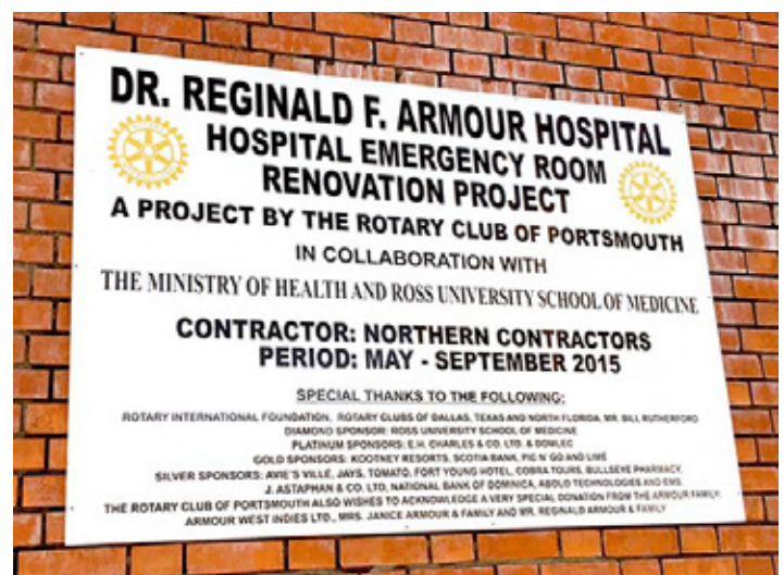
Opening of hospital emergency room