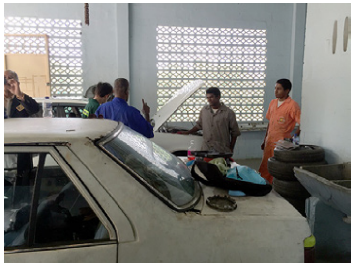
Students at Servol learning auto mechanics