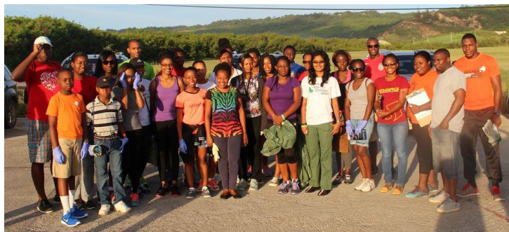
The Youth Team & The Team of Experience