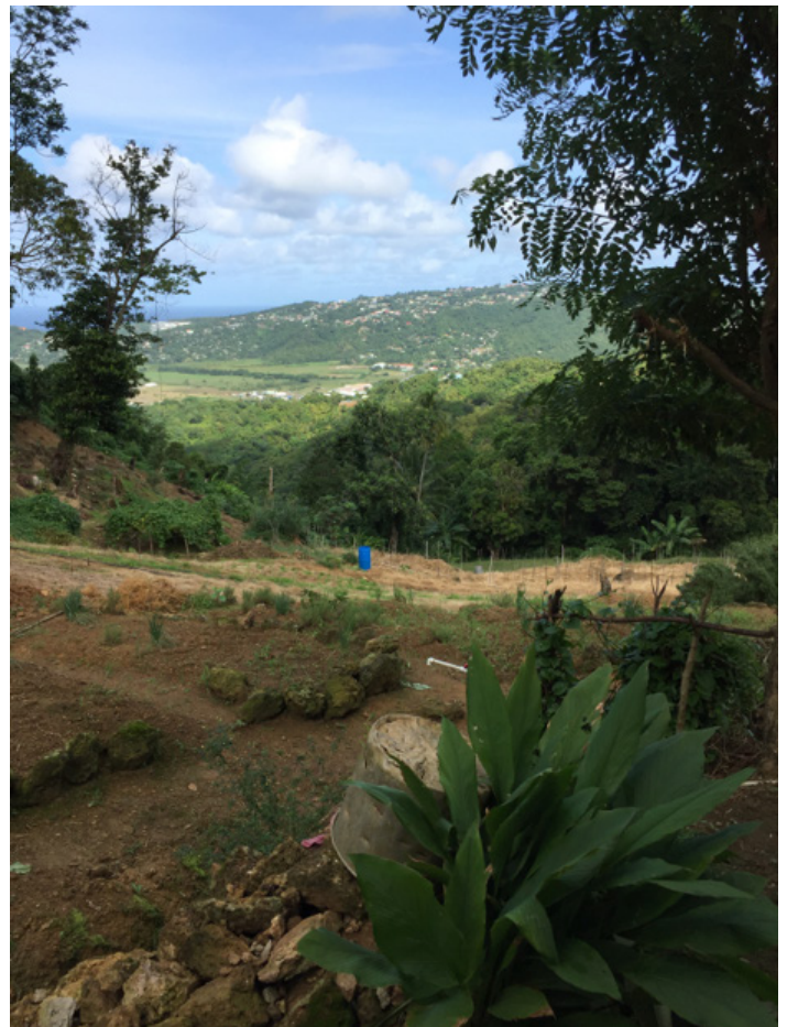
One of the small farming properties