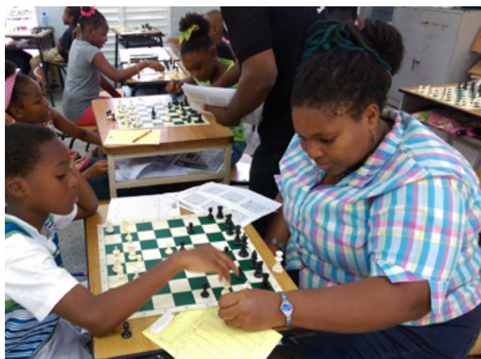
Adults/ Rotaracters game