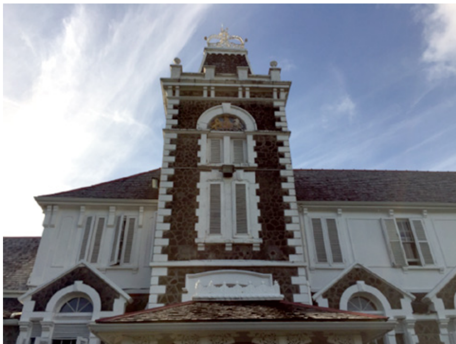
Government House St. Lucia

over, we had a visit to the Mobile Youth Clinic bus, a project of the Rotary Club of St. Lucia. That evening, we had a fellowship event, where I met Rotarians from both clubs.