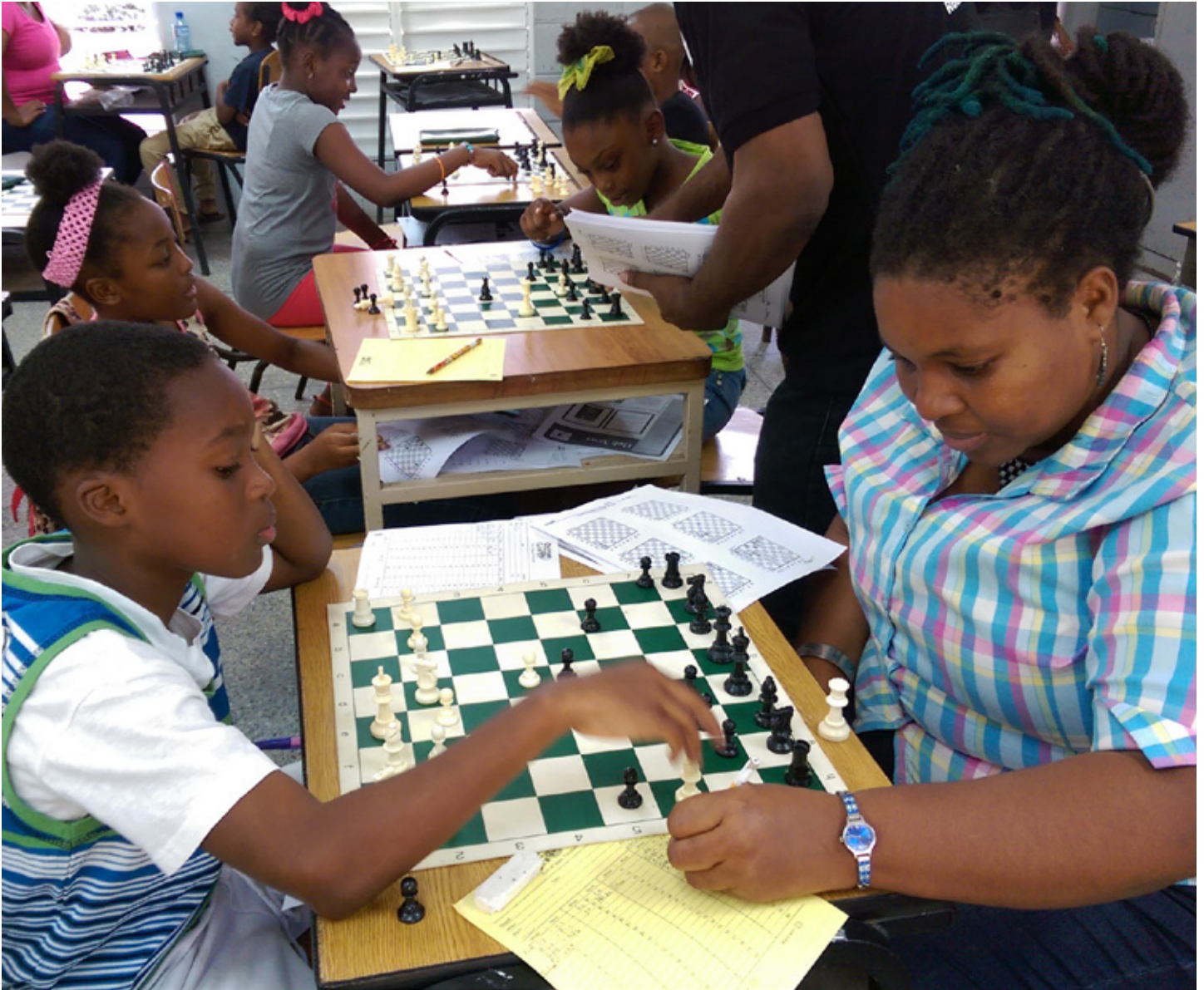
Mother and son playing chess