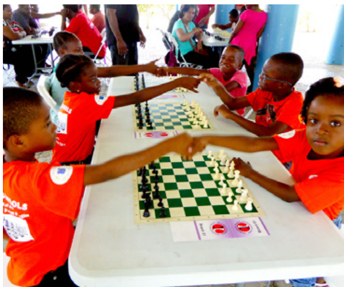
starting the game with a handshake