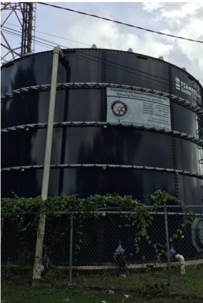
Babonneau Water Tank

The meetings with the boards of the 2 clubs were held the next day and there was a joint lunch meeting. After the meetings were