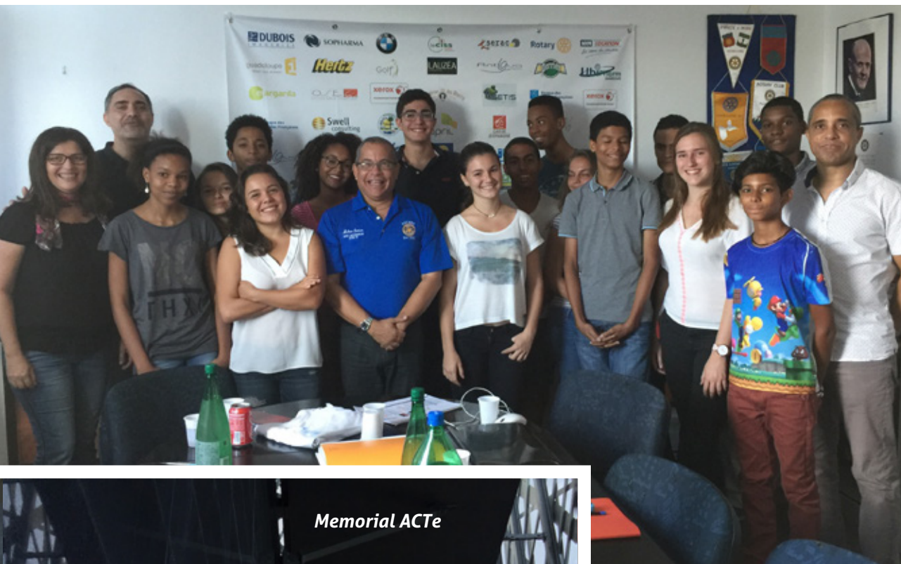
Meeting with Interact Club of Guadeloupe