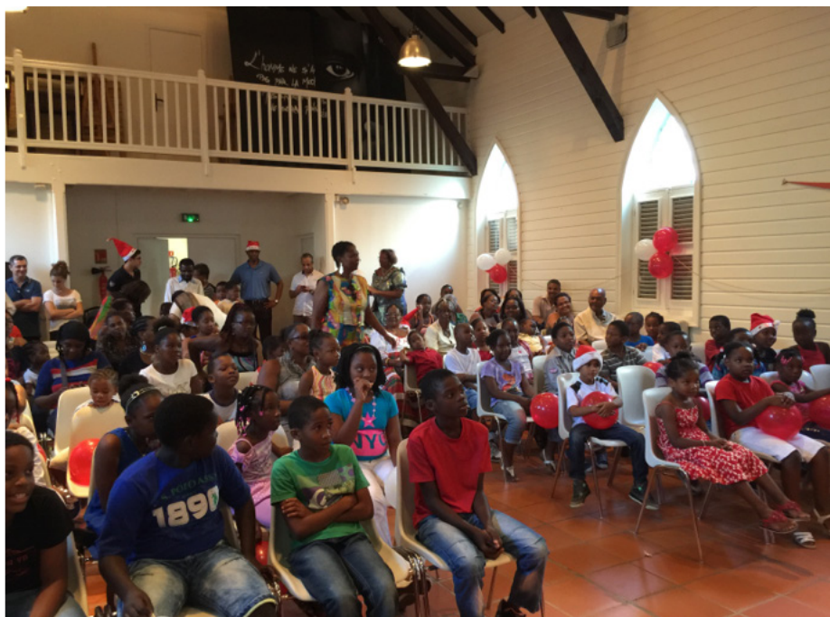
Kids waiting for Santa Claus