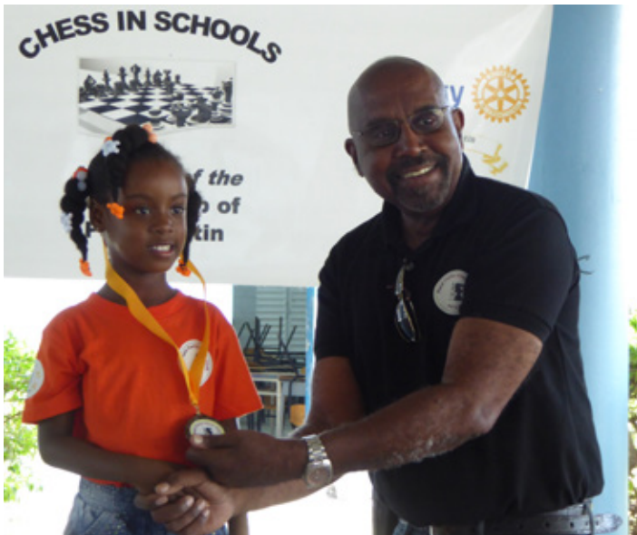
one of the winners of the boys category