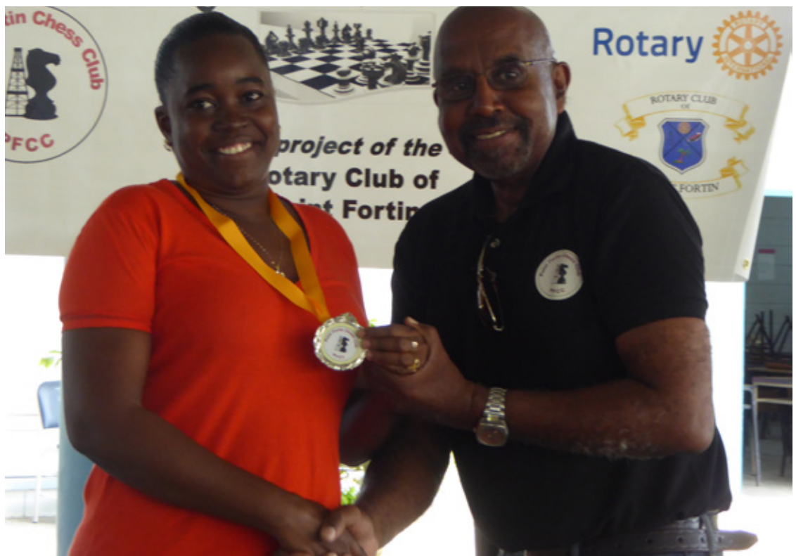
one of the winners of the adults category