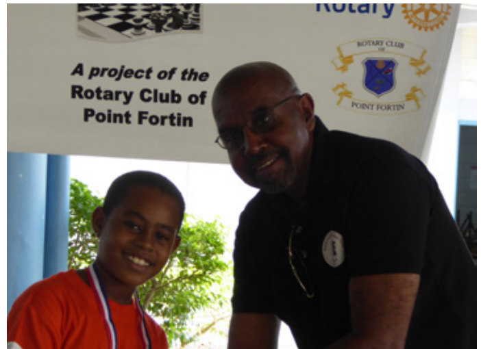
Adults/ Rotaracters game