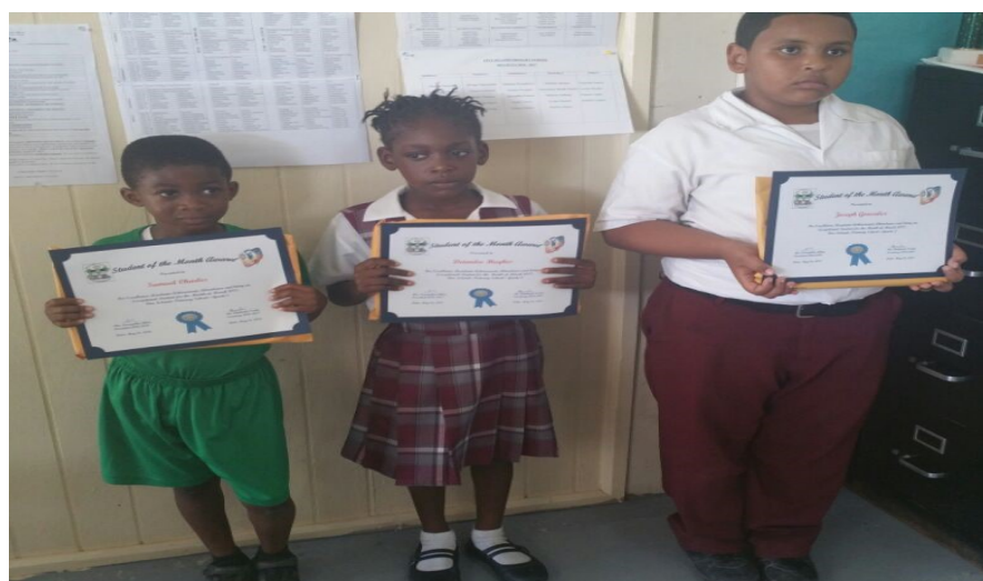
Five Islands Primary School