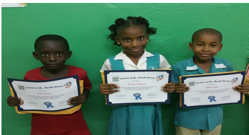
Golden Grove Primary School