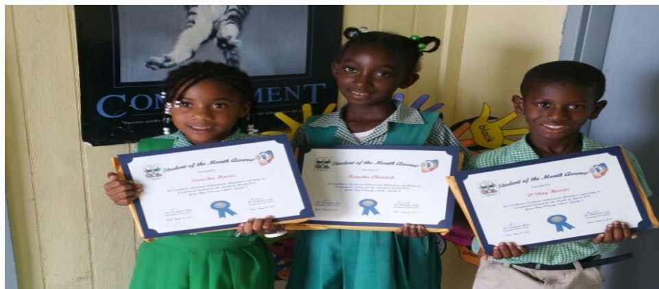
Green Bay Primary School